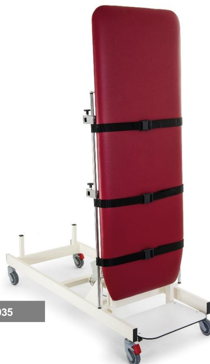
Frame color RAL 7035

Equipped with 4 swivel castors of which 2 locking.